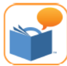
Reading Assistant Reading Assistant program