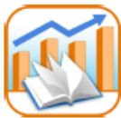
Reading Progress Indicator RPI assessments

Once you've downloaded an app, the App Store will notify you when updates are available. You'll also be notified when you open that app as follows. Always update the app as soon as possible.